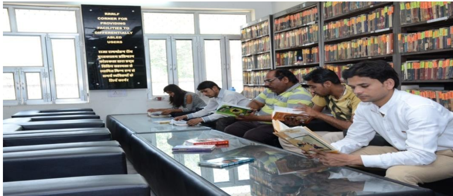
Image 5 Differential abled Lounge of Kota Govt. Divisional Public Library