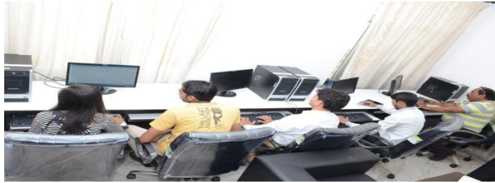
Image 6 E-Library in Kota Govt. Divisional Public Library