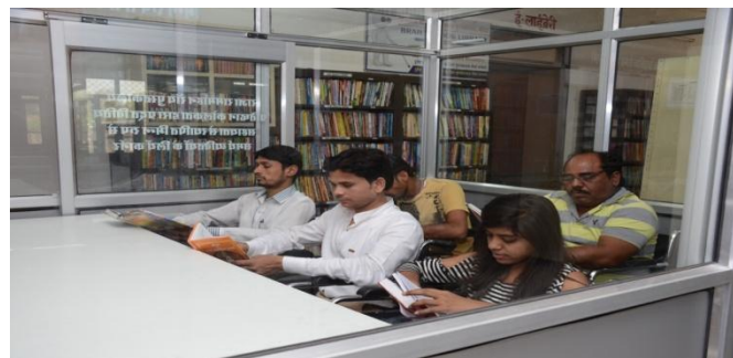
Image 4Audio Section of Kota Govt. Divisional Public Library