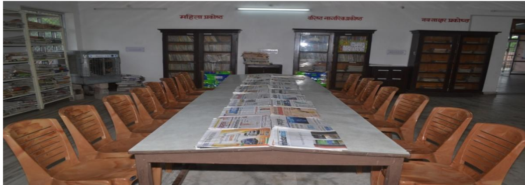
Image 3 Reading Area of Govt. Divisional Public Library, Kota (Rajasthan)

Our library has a wide range of materials. During last 62 years many valuable books were added to this library. Today the library is having various information books on different Subject like: Indian Philosophy, Religion Books, Business Management, Ethics, Moral Science, Agric books, Gandhi Yana, and Computer Science etc. details about collection are like