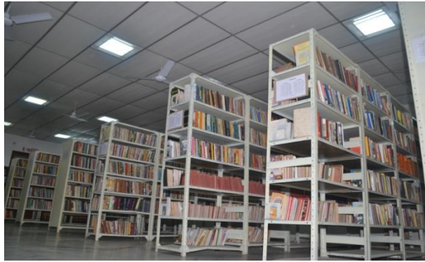
Image 2 Stack Area of Govt. Divisional Public Library, Kota (Rajasthan)

Administrative Division (Committee and Meetings, Budget and Accounts, General administration, Maintenance and Security, Stores, Stationary and Printing, Correspondences and Filing etc.) 6. Preservation Division (Preventive Unit, Fumigation Unit, Repairing and Mending Unit, Lamination Unit and Book Binding Unit).Kota Public library is aimed to serve Education, Information, Culture and Leisure and Recreation